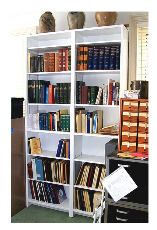
New Shelving in Research Room

As storage space in the Museum is always an issue, a rear upstairs room has been converted to a dedicated storage area, with