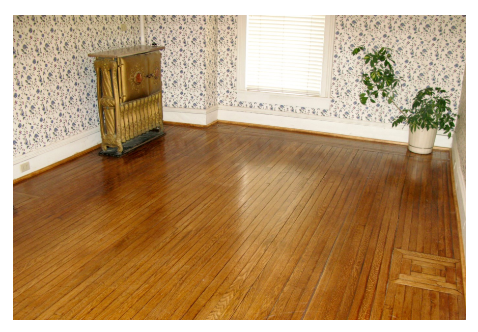
Would you believe this is actually the DINING ROOM?

Although having the Museum closed from January to April may seem like a long time to some, the months flew by as we tried to upgrade the Museum and our visitors' experience for 2013. We hope you will come by and see some of our changes and spread the word about the hidden gem that is the Brick Tavern Museum.