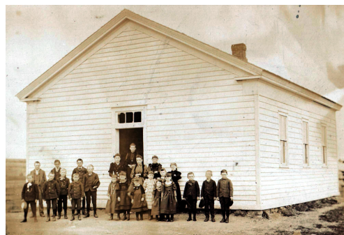
Wedgwood School in the early 1900s. The physical appearance of the school has not changed much today.

We are pleased to take possession of the Wedgwood School and look forward to working with the local community to upgrade and renovate the building in the future.