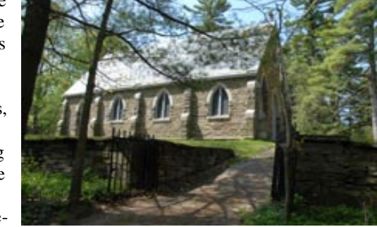
Beautiful Lawrence Chapel built in 1880.

Please contact the Museum at (607)535-9741 or treaurer@schuylerhistory. org for reservations or further information.